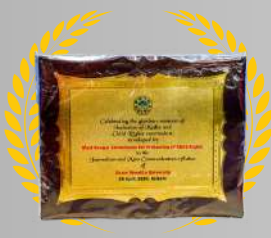
WB COMMISSION FOR PROTECTION OF CHILD RIGHTS