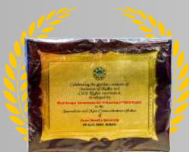
WB COMMISSION FOR PROTECTION OF CHILD RIGHTS