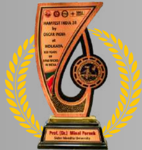
HAMFEST INDIA 2024